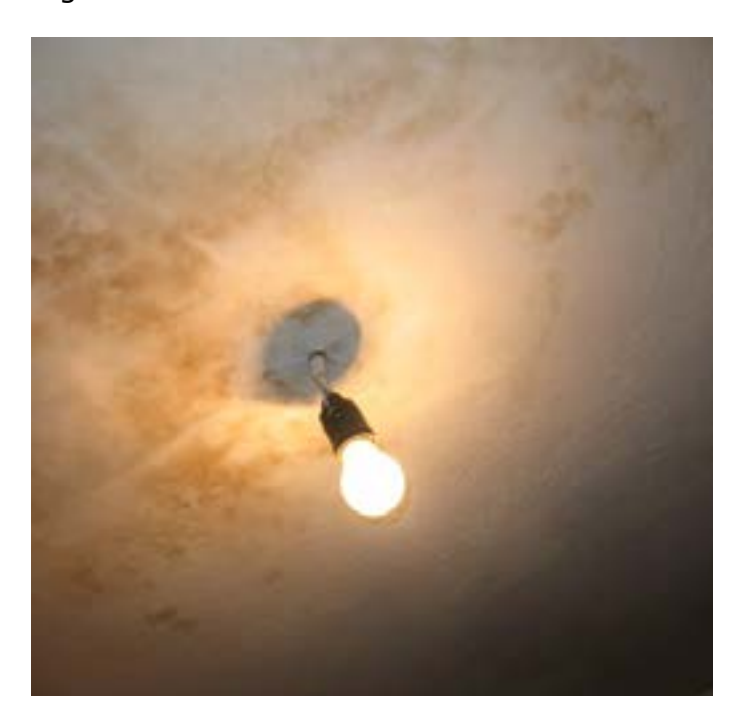
1.13. Collecting sex-disaggregated data with and intersectional perspective (race, age, class, ability...) on energy poverty

Raising awareness of gender issues and issues related to other intersectional social categories, as well as energy poverty, remains very important. There is a major deficit in awareness and capacity building – including enhancing expertise in this area – regarding gender and energy poverty, especially among the policy- and decision-makers. There is a need to develop a genderaware understanding of energy poverty, as well as the awareness that energy poverty is a gender issue.